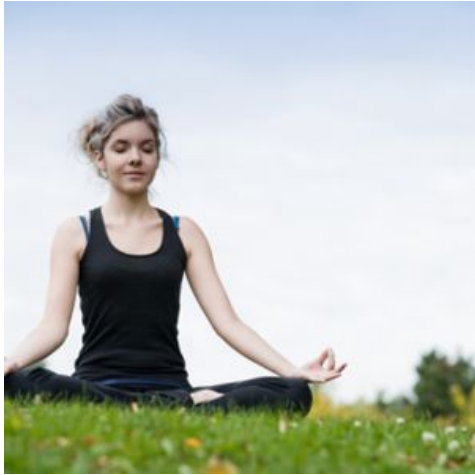
I feel very good