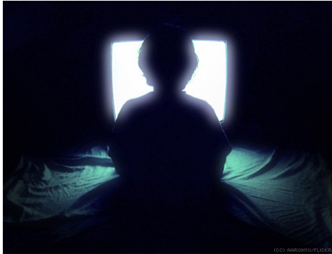
watch, to look