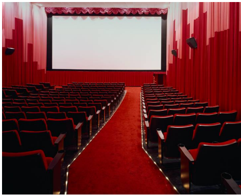
cinema, movie theater