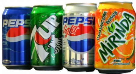
refreshments, soft drink