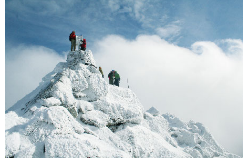
on top of