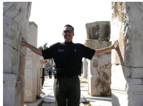
between, divided by