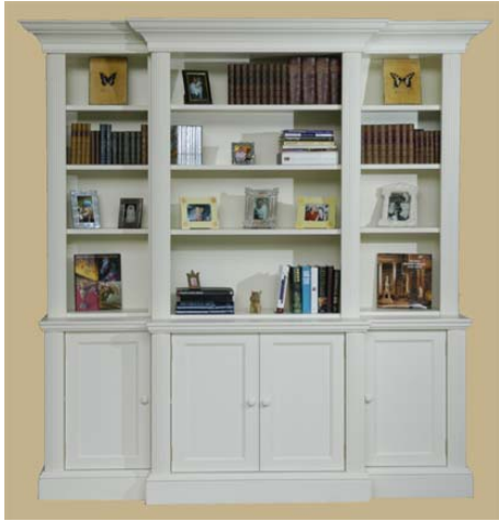
bookcase or shelves