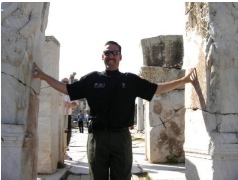
between, divided by