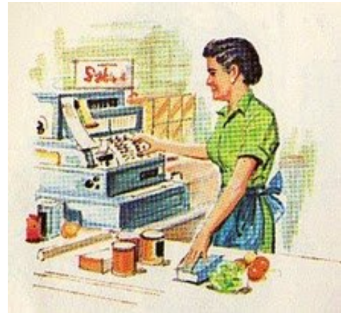
teller or cashier