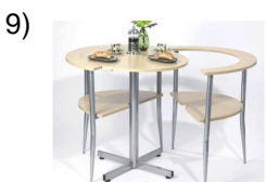
the little table