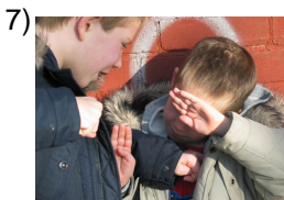
to bother, to bug