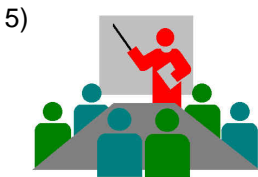
meeting, get together