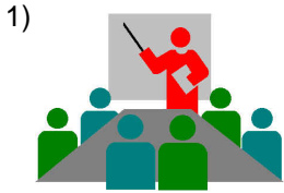
meeting, get together

Words to Match: embarazada - asistir - molestar - la reunión - la dirección - la carpeta - la noticia - actual